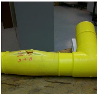
Figure 2 Burst Test