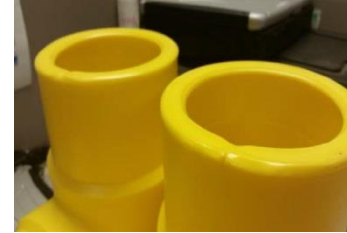
Figure 1 Example of dimple in the melt pattern

The appearance of a dimple in the melt bead, or in the melt pattern is an artifact of the molding process and does not represent a defect in the fitting, or an error in the fusion joining procedure. The appearance has no bearing on the quality and performance of the part. This technical note covers the reason for the appearance and the requirements for accepting the fusion bead. The note also documents the test results that show compliance with federal guidelines for joining qualification. Figure 1 shows the appearance of the dimple in a melt pattern after heating and prior to making the fusion joint.