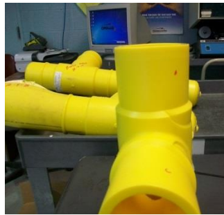
Figure 3 Crush Test